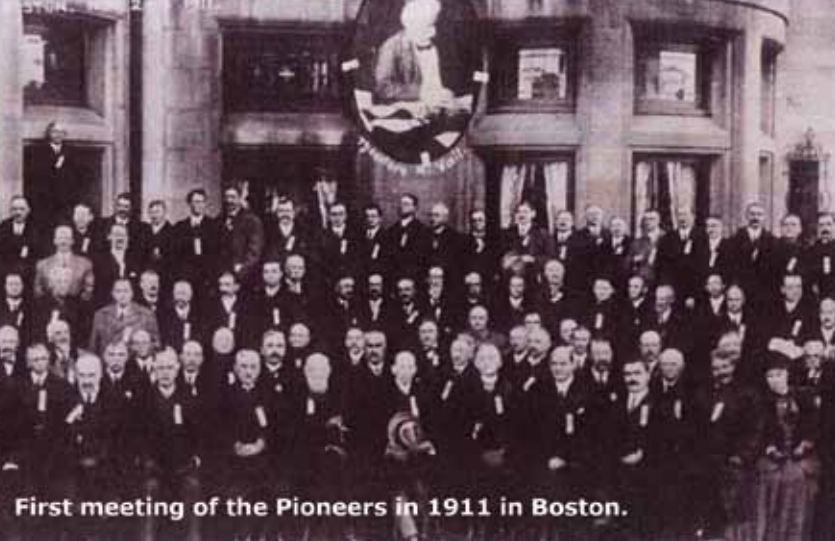
First meeting of the Pioneers in 1911 in Boston.